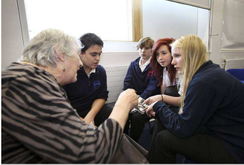
Figure 7: Intergenerational activity was part of the 'Conflict and the Media' project

Intergenerational activity was one of the key features of the TPYF2 programme as prioritised by MLA. A substantial number of projects (around 80% of the 92 projects in Years 2 and 3) brought together young people with a wide variety of people whose lives were, or had been, affected by war and conflict. Of the ten case studies, nine included a specific intergenerational element.