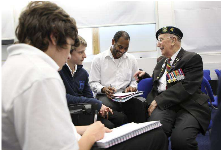
Figure 6: Young people enjoyed engaging with veterans of war and conflict, shown here is the 'Conflict and the Media' project

Through their interactions with veterans and eyewitnesses, and the process of sharing their memories, young people had the opportunity to empathise. Coming into direct contact with the emotions that these memories can elicit aided some young people in their understanding of the impact of war and conflict. This Year 9 student from Bristol was conscious of how powerful and memorable real people's experiences are: