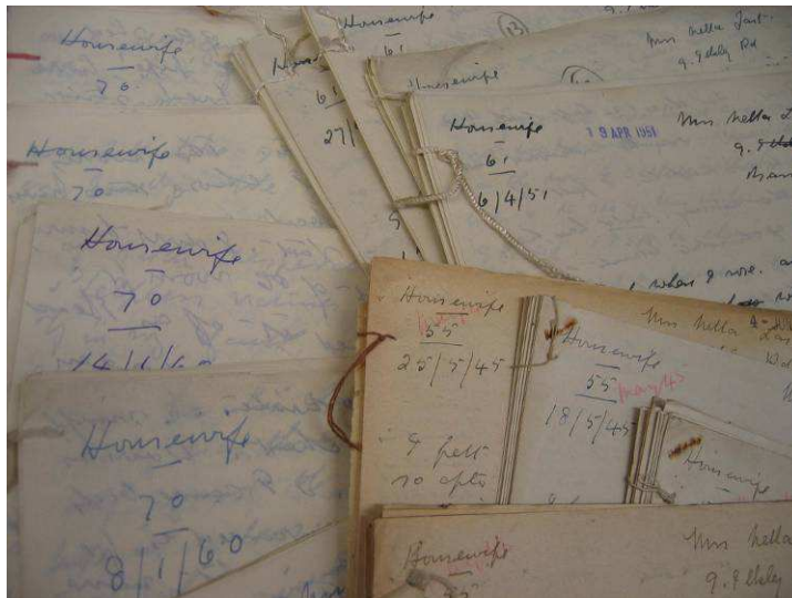
Figure 3: Collections from the Mass Observation Archive used in 'Post-Up: War of Images'

Museum, library and archive resources across the UK contain a wealth of resources connected to war and conflict that made them uniquely placed to explore the theme of TPYF2. From photographs to personal records of life during the war, from diaries to artefacts, and the memories contained in oral history archives, their collections provided tangible evidence of the impact of war and conflict, material culture that reflects the identity, culture and values of England's many diverse communities. Many of these collections were very special and unique. Collections spanned the breadth and depth of the impact of war and conflict, with resources that were relevant to the personal and the local along with the national and the global.