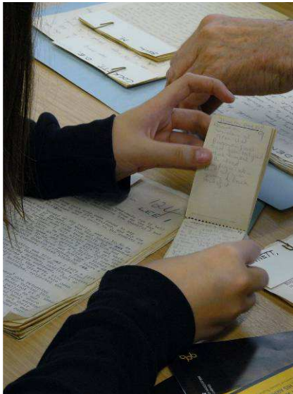
Figure 10: Engaging with the collections of the Mass Observation Archive for 'Post-Up: War of Images'

Libraries). Together, the programme provided rich insights into how 21 st century England has been shaped and affected by the impact of war and conflict at home and globally, forces that are not always evident or obvious in the physical environment.