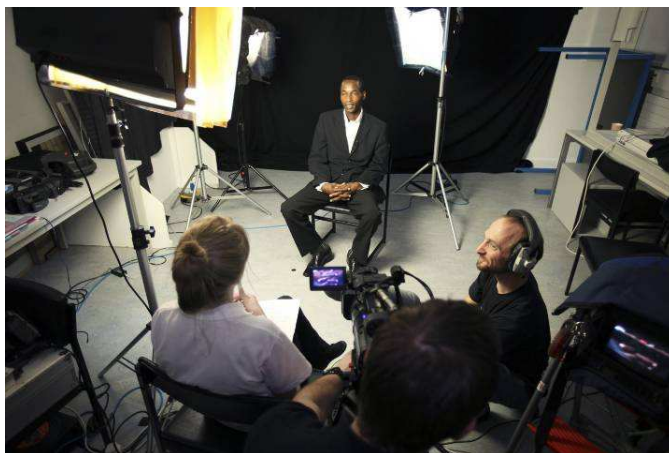
Figure 9: Young people filmed and carried out interviews for 'Conflict and the Media'

'It was great to hear how well the teenagers learnt and compiled the interviews' (Response card written by participant, 'Bridging Gaps').