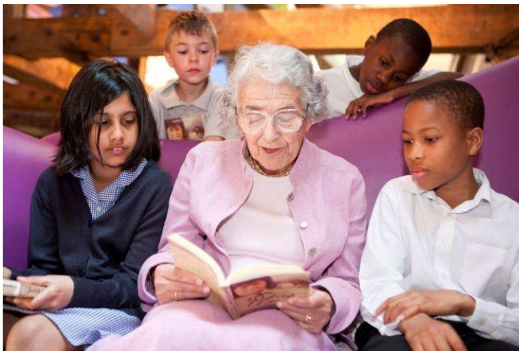
Figure 8: Children from Newcastle met author Judith Kerr as part of the project, ‘When Hitler Stole Pink Rabbit’

For the pupils of Christ Church CE Primary School in Newcastle meeting the author Judith Kerr challenged their perceptions of how older people should be and how they should behave. She was much more “with it” than the children expected and they treated her in a respectful way. Some of the children were surprised to find out that she had a sense of humour. Their teacher explained how the experience had helped them to understand that older people can be interesting to talk to and are not always infirm, helpless, or worthless: