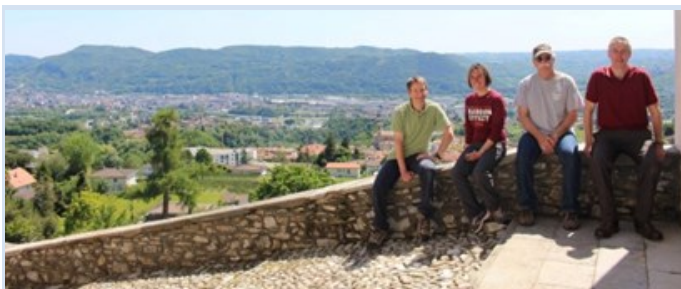
Obligatory team photo – Chantal is behind the lens