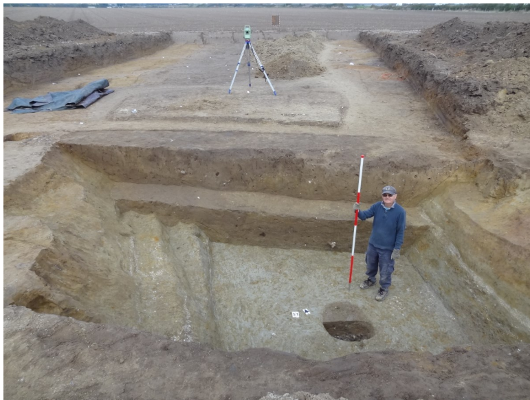
Ebbsfleet, Kent: the first century BC defensive ditch

The colluvium had protected the metallised surface from damage by ploughing and the finds on it - human and animal bone and several iron objects - were well-