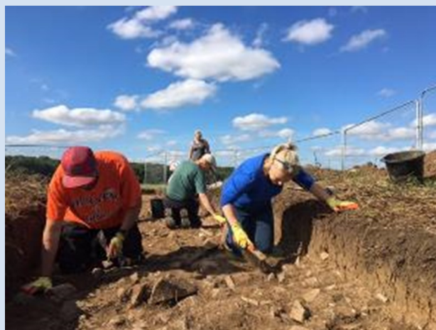
Volunteers working at Castle Hill