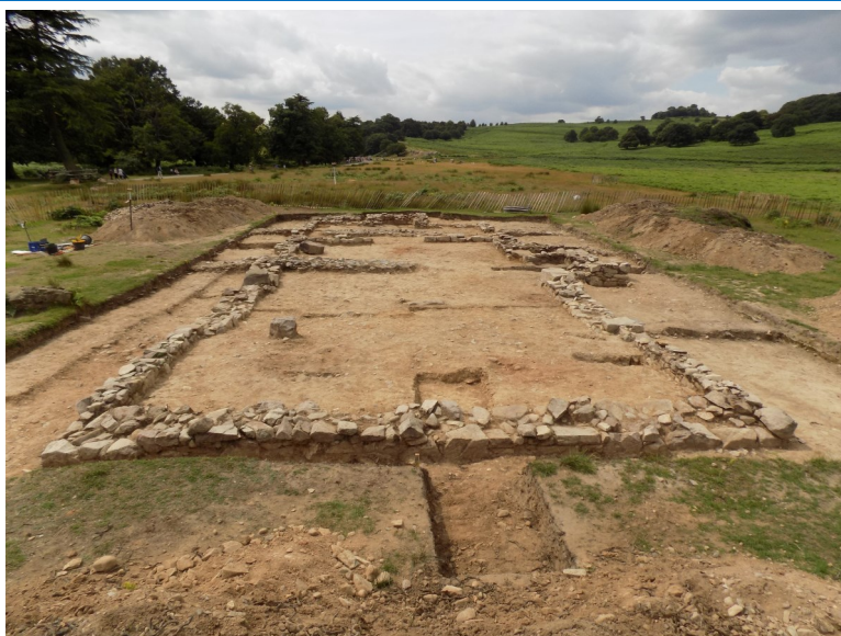
The moated site: is this the Park Keeper's lodge?

The main focus of the 2016 season was the moated site, reputed to contain the medieval park keeper's lodge. A large trench was opened on the platform, revealing the extent of the impressive rectangular building, which measured c. 21m x 8m and was defined by a dwarf stone wall. The structural component of the building was probably timber, indicated by pairs of padstones located at intervals along the wall, which would have supported large posts. There was a substantial fireplace on the northern wall, which would have heated the hall. A smaller external chimney occupied a central position on the western wall, probably for an oven located in the service bay. Our most prolific finds from the site were hundreds of variously-sized roof slates and fragments of green glazed ceramic ridge tile. Initial examination of the pottery suggests a 13 th /14 th century date. Plans to excavate further sections through the moat were prevented by inclement weather (who would have