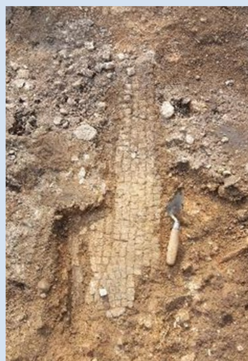
A tessellated pavement revealed at Great Central Street, Leicester

A small open day on the middle Saturday of the dig also attracted over 100 people and we have had several visits from local primary schools.