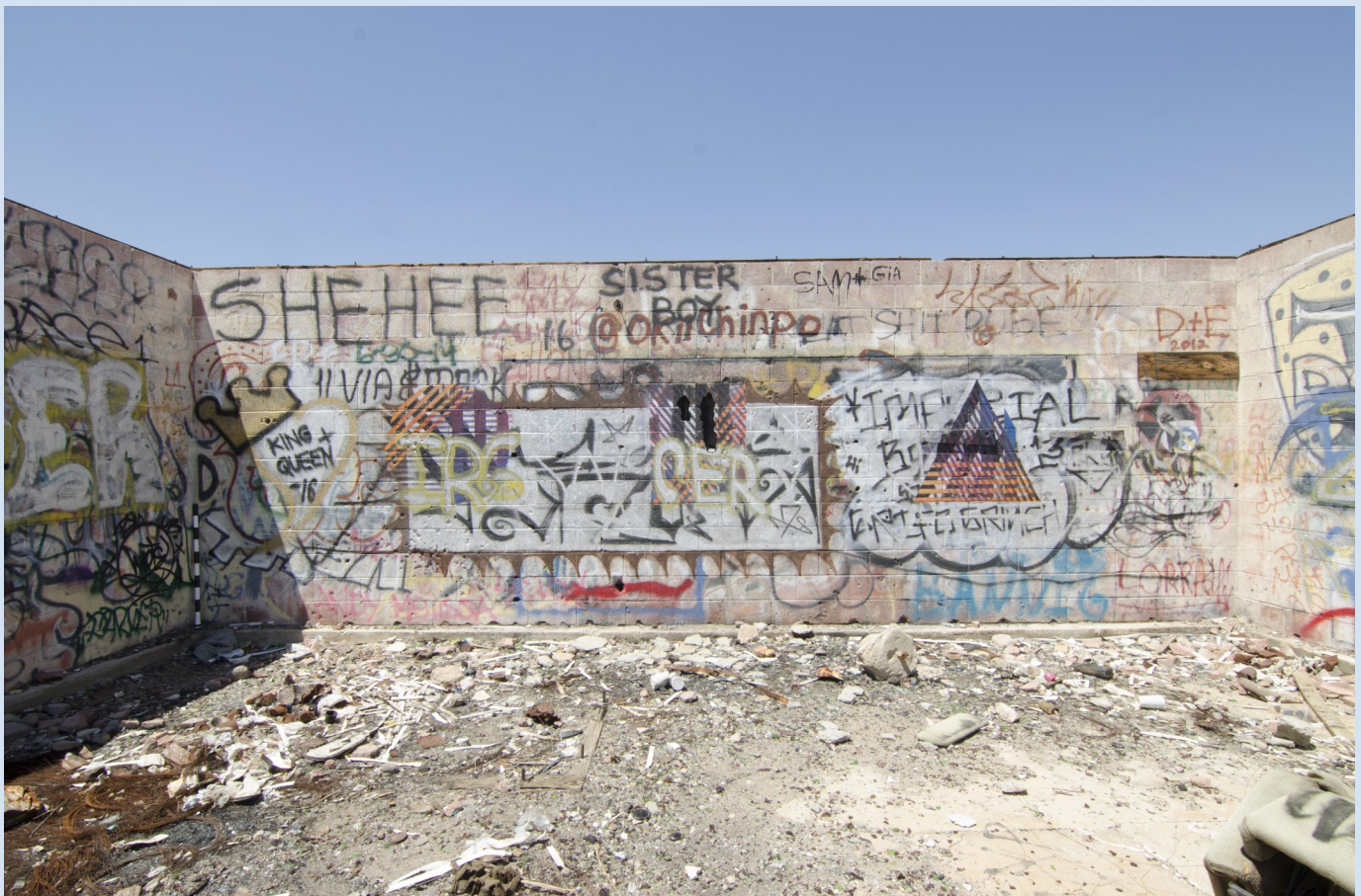
Graffiti at the Cadiz Summit on Route 66 – Mojave Desert