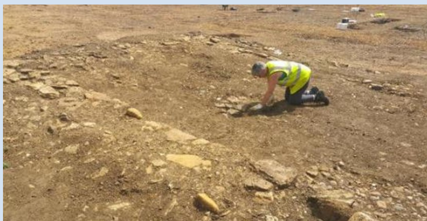
Excavation in progress of a medieval building at Kilsby

Our community based work has included helping with test pitting in Rothley as part of the Charnwood Roots project, excavating a Roman villa at Hallaton and an excavation at Castle Hill Beaumont Leys. The Castle Hill site has never been excavated before but was suspected to be the remains of a Knights Hospitallers manorial centre dating from the mid-13th to late 15th century. Over the two weeks of the excavation, we supervised 37 volunteers excavating three trenches across different aspects of the site.