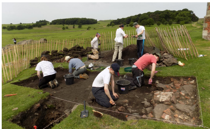
Excavating the midden area

Thank you to everyone involved with the project - it was a great team effort!