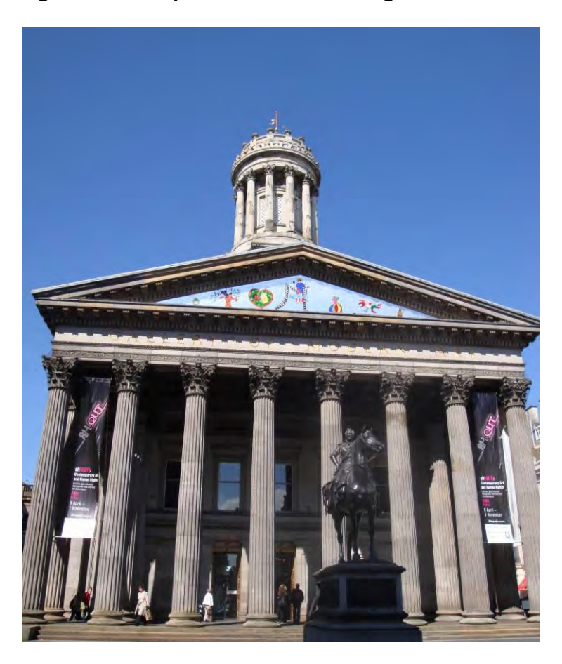
Figure 1: Gallery of Modern Art, Glasgow

This report documents the process of the evaluation (research design, methods, analysis and so on), presents the findings from the study (focusing primarily on the impact of the programme on visitors, public opinion and community participants) and concludes with some suggestions and questions that might be used by GoMA in thinking through their approach to future strands of the programme.