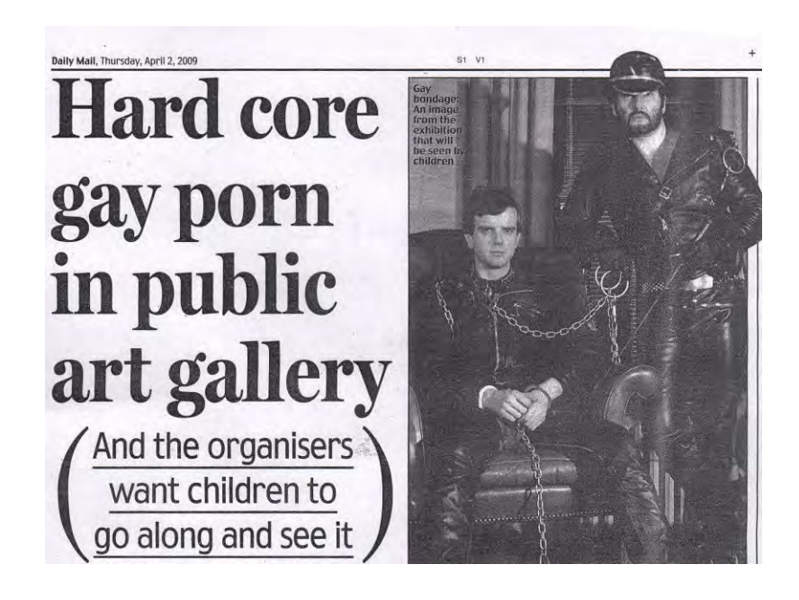
Figure 2: Headline from the Daily Mail highlighting the inclusion of images by Robert Mapplethorpe in the sh[OUT] exhibition

For others, they were deemed 'unhelpful to the cause' and seen to represent aspects of difference which some in the gay community were uncomfortable with being associated with. (These tensions surrounding, on the one hand, the celebration of difference and on the other, the shared experiences between LGBTI and non-LGBTI communities, were also strongly present in visitor responses. See section 3).