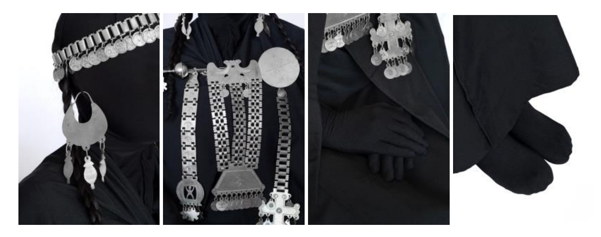
Image Credit: Paula B. Pailamilla, Mi cuerpo es un museo , 2021. The work consists of a live performance, a video performance and 4 photographs. Digital Photographs.

Description: In October 2019, Chile experienced a social uprising, known as 'Estallido Social', with protesters filling the streets of Santiago demanding a fairer and more just society and an end to neoliberalism. As the mobilisations progressed demonstrations and rioting moved to all regions of Chile. Students and young people were at the centre of this revolt, 'tired of an unequal economic system that makes no sense for them and that must be changed' (Rivera-Aguilera and Jiménez 2020). Statues of the country's forefathers were toppled, whilst at the same time, indigenous visualities and languages were reclaimed (Vargas Paillahueque 2023: 224).