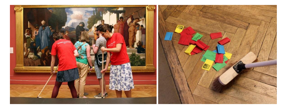
Image credits: Suzanne Lacy, Cleaning Conditions, part of Do it 2013, Manchester Art Gallery.