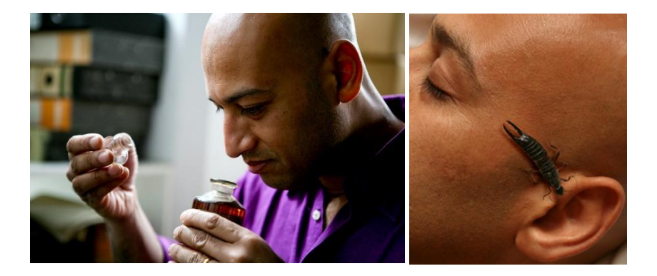
Image credits: Ansuman Biswas, The Manchester Hermit, 2009. Manchester Museum, The University of Manchester.

Description: Ansuman Biswas' satirical performative practice in The Manchester Hermit was approached as a form of ethical intervention, enacting loss in order to sensitise people to environmental and ecological crises and the extinction of species and habitats on a planetary scale. The intervention also exposed and revealed institutional practices in an attempt to share authority and decision-making processes with the museum's audiences and broader public, highlighting the