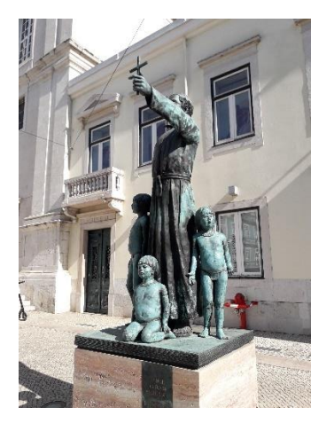
Image credit: Padre António Vieira statue, Largo Trindade Coelho, Lisbon. Source: Courtesy of Carlos Garrido Castellano

11. A performative poetic reading by Descolonizando around Padre António Vieira statue, 2017, Largo Trindade Coelho, Lisbon, Portugal