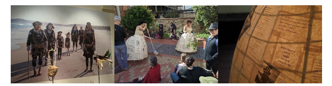
Image credits: Installation of Grandmother Lore , left, featuring artefacts and The Djaadjawan Dancers prepare for ceremony photo by Justine Kerrigan, courtesy Stella Stories and Australian Museum 2018. © Stella Stories. Unbound Collective, Sovereign Acts IV: OBJECT, centre and right, The National: New Australian Art 2019, Art Gallery of New South Wales, Sydney. Photos by Cesare Cuzzola.

4. TARNANTHI Festival: Grandmother Lore and Sovereign Acts: In the Wake , 2019, Migration Museum (as part of the TARNANTHI Festival), Adelaide, South Australia