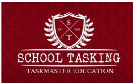
School Tasking logo

The students have been involved in the School Tasking initiative, linked to the comedy TV show Taskmaster, going into primary schools to deliver fun, engaging and very interactive sessions about the law. They have launched fundraising initiatives, including a school supply donation bank and a bake sale. Their podcast series continues to grow.