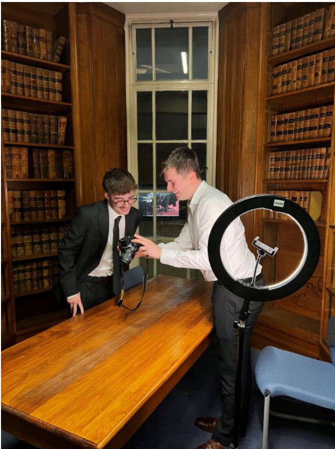
Pro Bono photography event to raise funds for charity

This year, the Project LIGHT team has contributed through donations to The Bridge Homeless Shelter, hosted a Headshots event with the Immigration and Asylum project, organised a Charity Games Night with university law societies, and created infographics to raise awareness about homelessness.