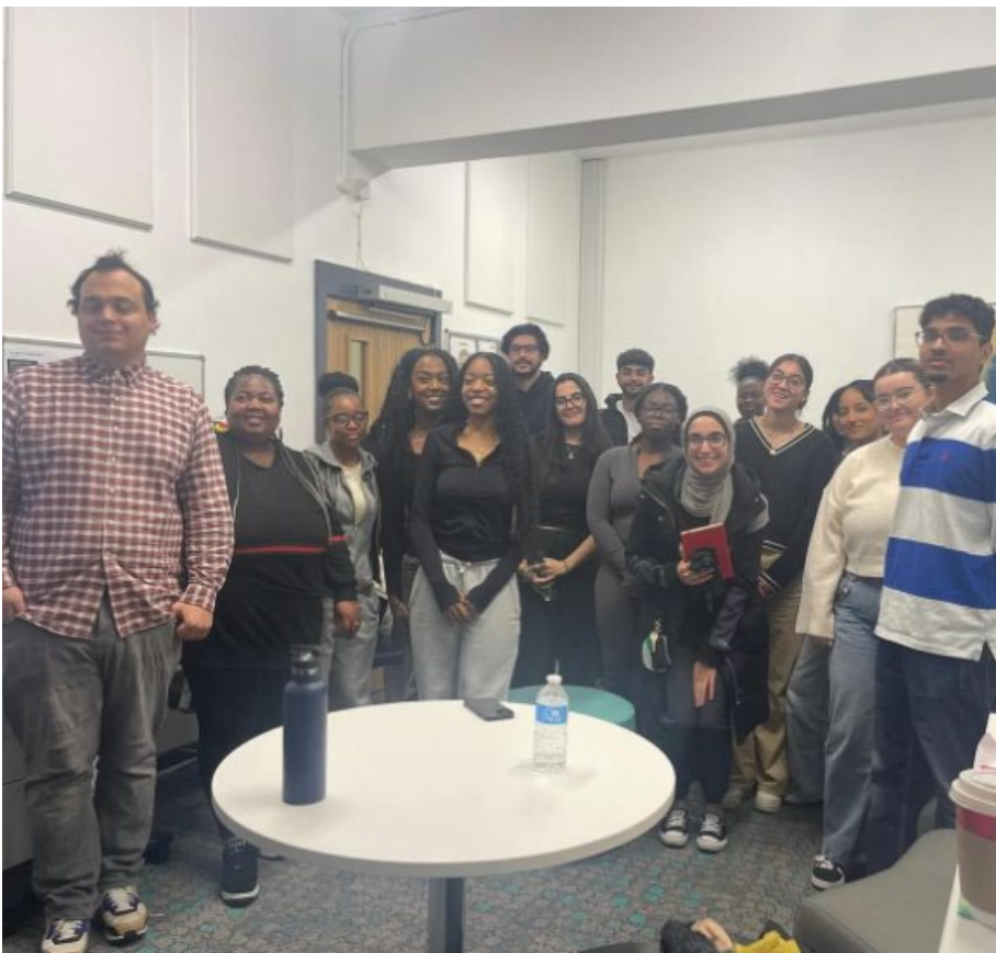
Windrush Home Office Advocacy Training in the Clinic

The students took part in Home Office Advocacy training workshops this year to improve their casework skills, and they took part in some fundraising for the African Caribbean Centre.