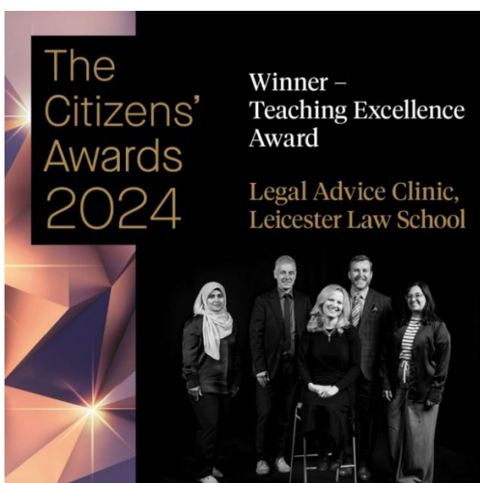
Clinic Team celebrate Teaching Award win in the University's Citizens Awards