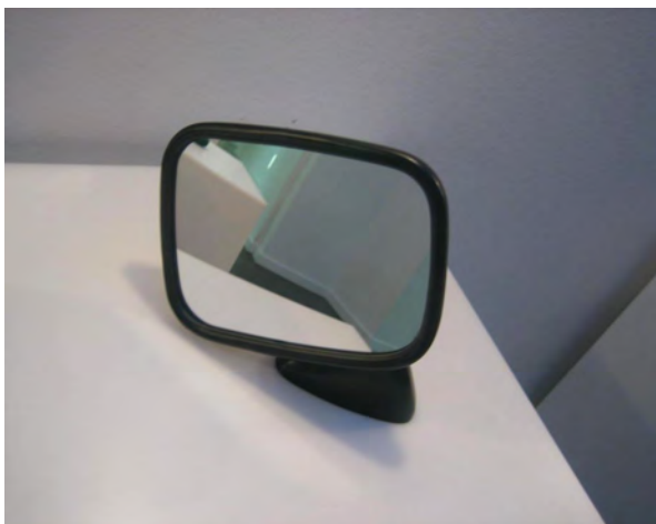
Figure 1:5 A side-view mirror, 1983 – 1988, Zagreb, Croatia "One night his car was parked in front of the wrong house. He paid for that negligence with his side-view mirror. I was sorry afterwards since the car was not to blame. The wipers also got their share, but they were made of more solid material and thus stayed on the car. The following day, when the "Gentleman" came home, he told me a weird story about some hooligans who tore off his side-view mirror and bent the wipers. It was so funny that I was tempted to confess. Still, since he never told me where he had been that evening, neither did I. It was the beginning of the end of our relationship"