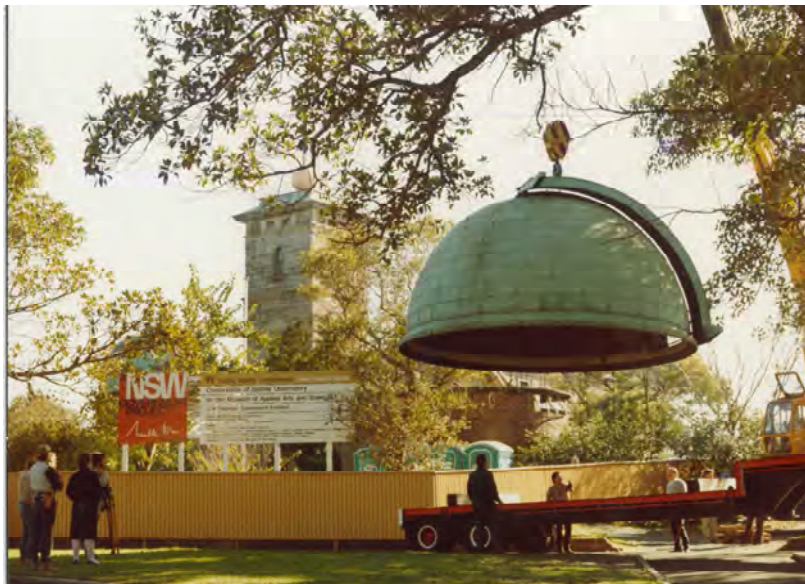
Figure 3:5 Moving the Astrographic Dome from Sydney Observatory, 1986.

While in Australia the Carte du Ciel does not appear to have made inroads for women in astronomy, there is a vast legacy of material from the project that remains unresolved. This holds potential to acknowledge their presence. In 1986 the Astrographic dome, the plates, the Hilger measuring machine and Star Cameras were removed from Sydney Observatory (Figure 3:7). Moves have been made for their return and with that there is the opportunity for women to re-appear in the history of astronomy on this site.