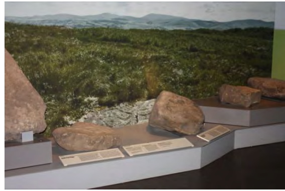
Figure 2:6 Rock-Art In A Museum Gallery