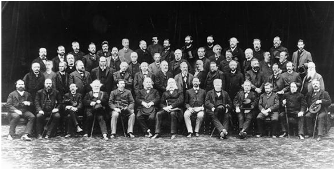
Figure 3:1 Participants in the Carte du Ciel and Astrographic Catalogue meeting held in Paris, 1887.

over the past century. This paper discusses the participation of women, and, by referring to Bruno Latour's Centres of Calculation and Accumulation theory, briefly touches on the colonial perspective.