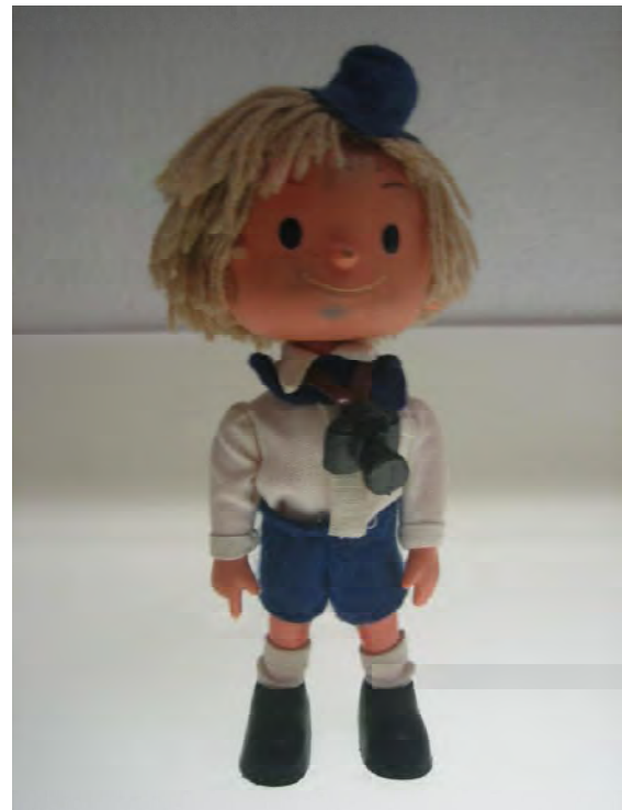
Figure 1:4 A pioneer photographer, 1996-2000, Berlin, Germany. This little pioneer is related to our story the same way the former Eastern Germany (DDR) was related to Western Germany (BDR).