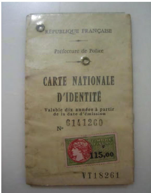
Figure 1:3 A French ID, February 1980 – June 1998, Ljubljana, Slovenia. The only thing left of great love was citizenship

of broken relationships. In other words, instead of watching a play, visitors read the texts and observe the artefacts in order to reach their own interpretation of the story. The meaning of these objects is therefore determined by the way visitors experience the 'performance' of the objects. Meaning is created in the complex play of significations that occur between the material item and the verbal explanation. The text and the artefact form interdependent relationships which offer multiple ways of understanding the message that is conveyed. Objects such as the French ID (Fig. 1:3) will be read differently than, for example A pioneer photographer (Fig. 1:4) or A side view mirror whose text explains the events leading to the break up in more detail (Fig. 1:5).