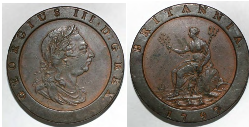
Figure 5:1 George III 'cartwheel'- regal issue - 1797 - author's coin and photograph, JPEG files