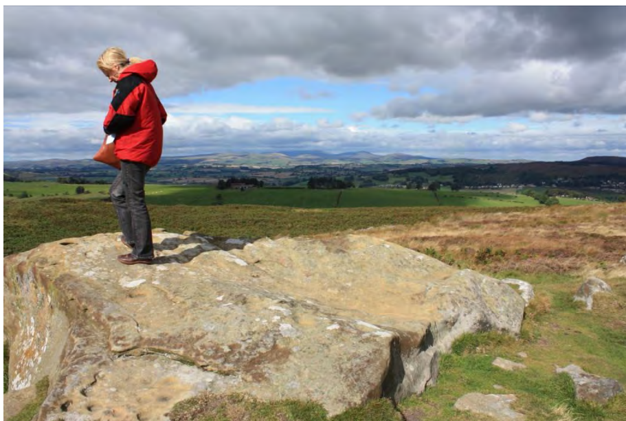
Figure 2:3 Communing With Rock-Art