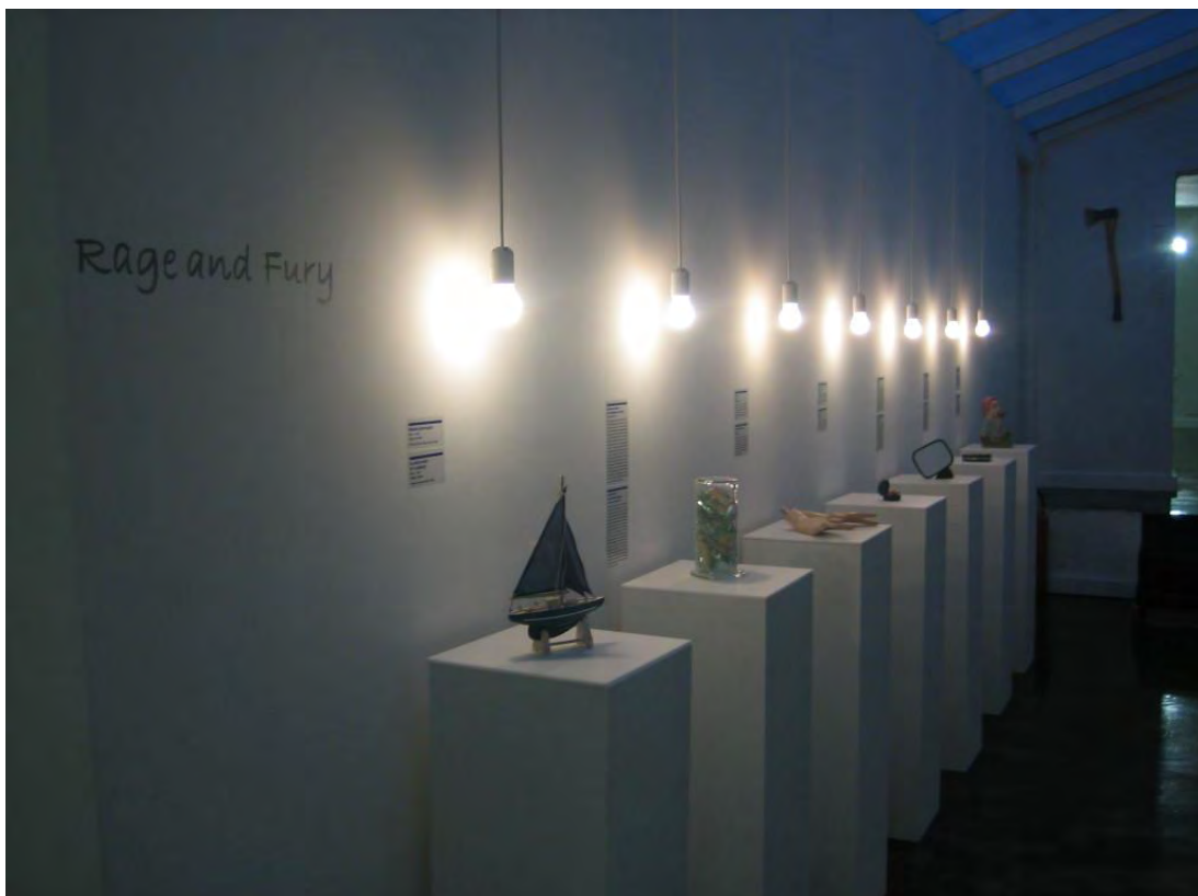
Figure 1 2 Museum interior

...I wanted to give it to someone. But who would take a dress whose first dance ended in big ugly fall? Then I wanted to throw it away, put it next to the garbage container in the street, maybe someone would use it to wipe the dust or scrub the floors. But I couldn't. So I decided to donate it to the museum.