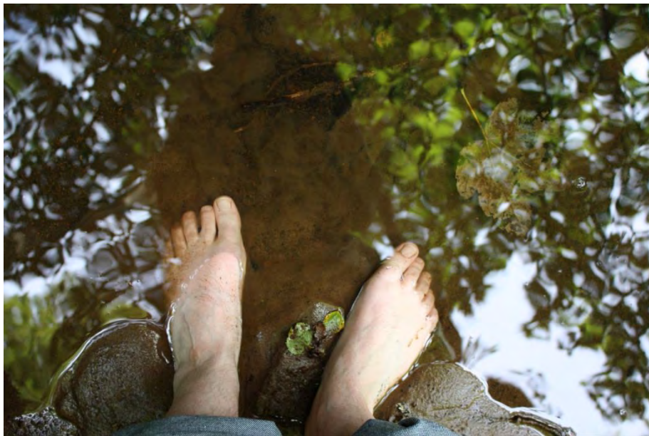
Figure 2:2 Barefoot at the Roughing Linn Rock-Art Site

and with an openness to the newness and strangeness of the experience. People do not know what is expected of them and have 'to make it up as they go along'. The average visit at each rock-art site lasts two hours (plus travelling time). Some of the visitors walk barefoot and feel the textures of the rock-art and surrounding terrain through their feet (Fig. 2:2). They climb on the rock-art (Fig. 2:3), sit on it, lie down on it, place cheek against the stone, trace the contours of the rock and the grooves of the rock-art with their toes and fingers. As the visit progresses people sit scattered on the rock, relaxed, chatting quietly. Some curl up and appear to fall asleep in the sun. Some pray in the presence of the rock-art: 'It feels good to pray out of doors; where there is no ceiling, no roof, between myself and God [...] that was so special for me.'