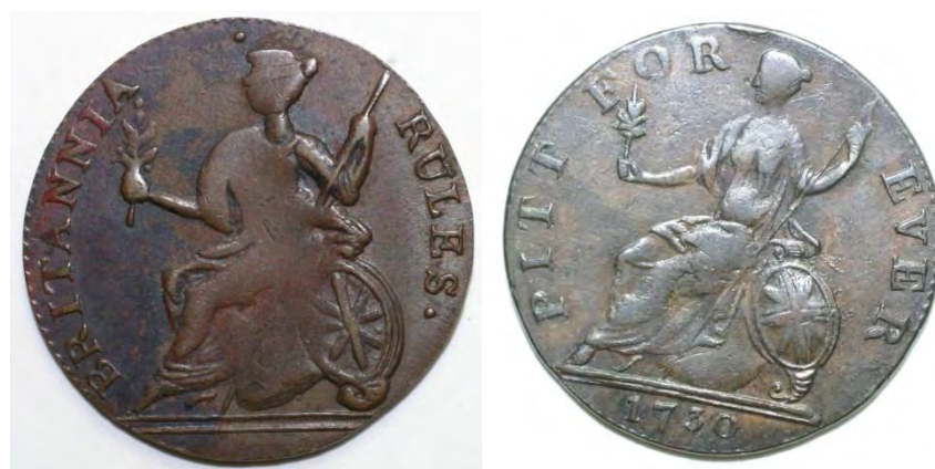
Figure 5:3 Two copper evasions - one with Britannia Rules on reverse and one with Pitt for Ever on reverse - Heberden Coin Room Ashmolean Museum of Art and Archaeology, University of Oxford, - author's photograph, JPEG files