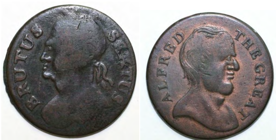
Figure 5:2 Two copper evasions - one with Brutus Sextus on obverse and one with Alfred the Great on obverse - Heberden Coin Room Ashmolean Museum of Art and Archaeology, University of Oxford, - author's photograph, JPEG files