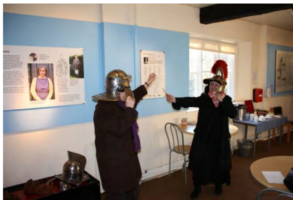
Figure 2:8 Playing In A Museum Cafe

Talking over the museum visits, members of the group reported no particularly significant response to the rock-art displays in museums. The visits were not that memorable; merely mildly pleasant experiences; an opportunity to socialise with friends and any place one could sit down and share a meal could do for that purpose. No one described the museum visits as healing, spiritually significant, inspiring or empowering or kept any mementos of the visits. The museum visits did not give rise to dreams. Nor did anyone report any significant life changes resulting from visiting rock-art in museums: 'I can honestly say I have never learned anything from visiting a museum'.