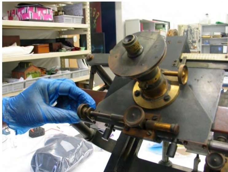
Figure 3:4 Harley W. Wood, Director of Sydney Observatory, using the Melbourne Astrographic Telescope in the Astrographic Dome, 1958.

The machine and the measurers were an essential part of the scientific process. Stability for the measuring machines was essential and sturdy tables were procured. The measurers rotated every thirty minutes to reduce eyestrain and promote concentration. On some plates there could have been as many as 5,000 stars (Turner, 1912:62), on others less than 100. To reduce error the plates were measured at least twice. Sydney Observatory women measured 743,593 stars in its region (Wood, 1960: 1279) plus a number of the transferred Melbourne plates.