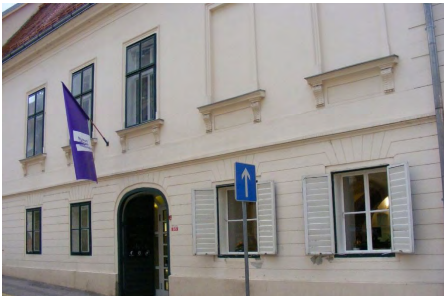
Figure 1:1 Museum building, 2 Sv. Cirila i Metoda Street, Zagreb