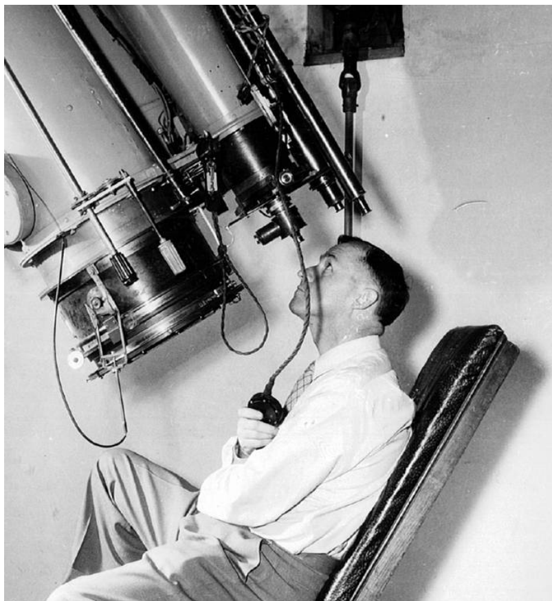
Figure 3:3 Harley W. Wood, Director of Sydney Observatory, using the Melbourne Astrographic Telescope in the Astrographic Dome, 1958.