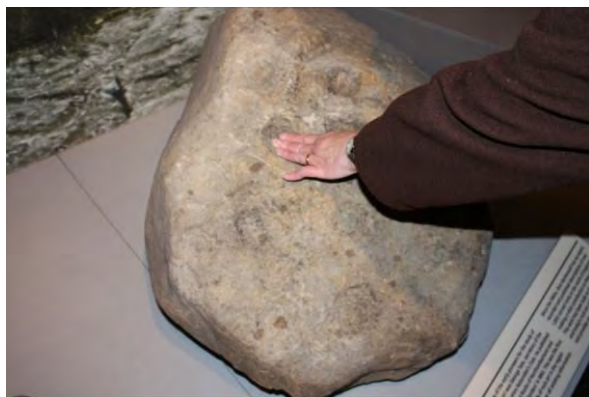
Figure 2:7 Touching Rock-Art In A Museum Gallery