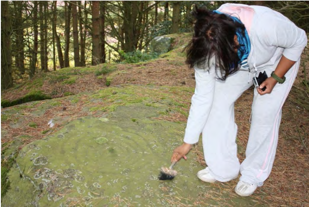
Figure 2:4 Improvised Rituals at Rock-Art Sites

involved haptic experiences (e.g. walking barefoot at rock-art sites) or involved rituals (both pre-existing rituals adapted on site e.g. praying at the sites and new rituals spontaneously created on site e.g. stroking the rock-art) or were materialised into 'tangible memories' which could be hoarded (e.g. when found objects or photographs were taken home from visits).