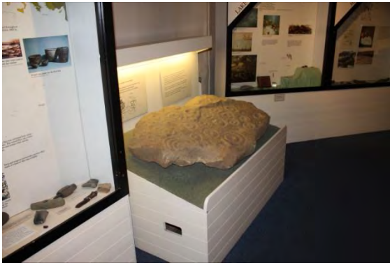
Figure 2:5 Rock-Art In A Museum Gallery