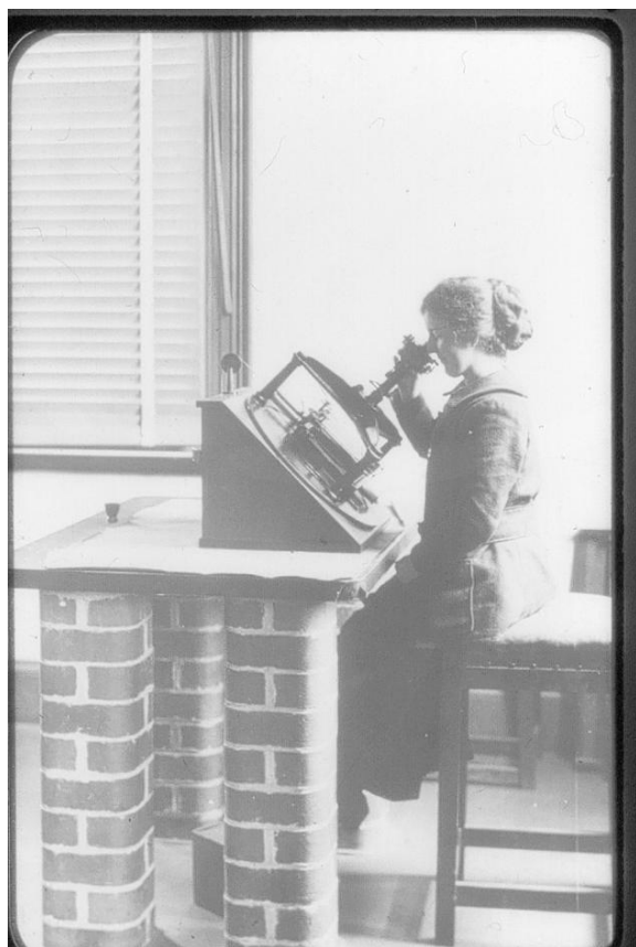
Figure 3:2 A measurer at Melbourne Observatory employed for the Astrographic Catalogue c1902.

The Carte du Ciel has been compared by Bigg to the industrialisation of the artisan's craft through the factory production line. After it was clear that Paris would not measure and reduce all the glass plate negatives, Melbourne and Sydney combined forces and employed women for the time-consuming role of measuring the glass plates and cataloguing the results (Russell, 1902). Australia's Perth Observatory astronomer employed two local women and also, after much correspondence, commissioned Edinburgh Observatory Director, Frank Dyson, to employ two local Scots women for measurement of some of the Perth plates. One Scot, Miss S. Falconer, measured the glass plates from 1909 until 1916 when she left to volunteer in the War effort in France, leaving no other record of her career. These plates were originally shipped from England, exposed in Perth Observatory through the Star Camera, shipped back across the ocean to Edinburgh for measuring and then back to Australia for compiling (Kidwell, 1999:231) 6 .