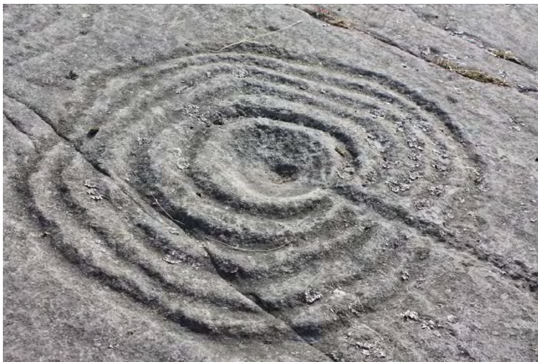
Figure2:1 Northumberland Neolithic Rock-Art

I co-organised the 'Feels Good' Conference at the Great North Museum: Hancock, June 2010 with the aim of inspiring research on the therapeutic museum in North East England. The conference led to the formation of a research and development group comprised of academics, museum professionals, and community representatives. The group decided to open up the question of what a therapeutic museum could be by moving beyond the conventional medical model to explore the relationship between spirituality and healing and how museums might support this. Exploration began with a pilot study examining Northumberland's Neolithic rock-art (Fig. 2:1; Beckensall, 2001; Sharpe et al , 2008). The group is visiting rock-art in the field and in museums and analyzing the results. As an anthropologist, I track their activities through participant observation.