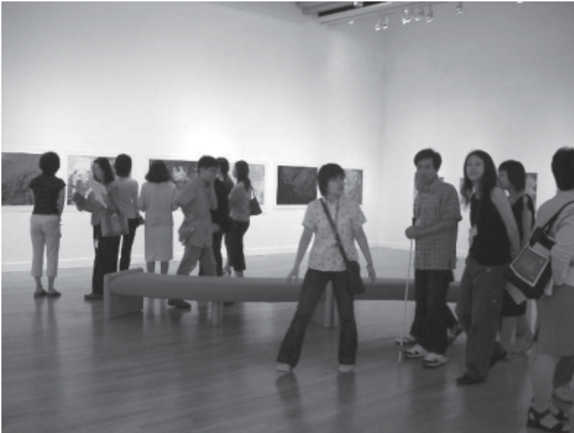
Figure 1: Performance in the workshops

The questionnaires were gathered in workshops at two sites: the AIXS Gallery (which is an exhibition space run by an independent company in Tokyo, AXIS Inc.), and Setagaya Art Museum (which is a local authority museum also based in Tokyo). The workshops were organised not by the galleries themselves but by museum access groups ('Museum Access Group MAR' in the AXIS Gallery and 'Museum Access Group VIEW', 'Nagoya YWCA' and 'MAR' in the Setagaya Art Museum). Various types of exhibits were used in the AXIS Gallery, half of which were touchable objects, whilst the Setagaya Art Galleries exhibited only two-dimensional artworks.