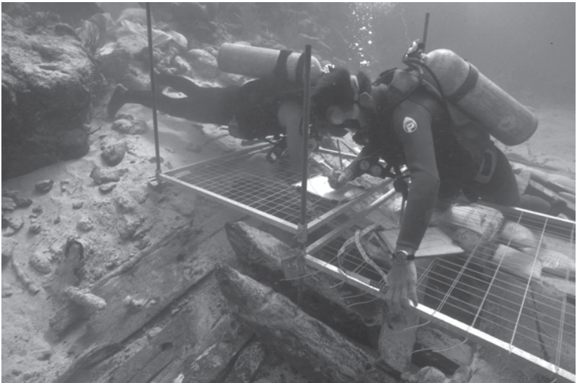
Figure 4: Underwater archaeologists surveying the Pollockshields, circa 1990.

Many subtle and complex issues arise out of these understandings and the challenging and ongoing process of coming to 'hear' them as a vested heritage professional. Though I inevitably interpret the interviewee data through an archaeological lens and perhaps perpetuate an archaeology-salvage dichotomy in my interpretation and language, I have tried to be led along by the interviewees in addition to archaeological principles. Being located among 'alternative' understandings, if only for a short while, has instigated my reflection of existing management approaches of Bermuda's underwater heritage. It has provided contextualisation for earlier heritage advocacy and policy but also a more critical eye towards designing new ways forward for localised best practice in archaeology and museology.