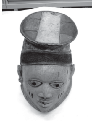
Fig 10. Gelede mask, 0.8283, Lees 1951.

The collection and donation of ethnographical objects to the Manchester Museum thus provided a middle-class family with an inroad into various social circles. The influence of the Lees family would have been clearly visible at the Manchester Museum during the mid-twentieth century and it can be argued that their legacy remains embodied in the Museum today through the funds they subscribed as well as through their extensive collection of objects. The Lees collection thus illustrates how a biographical approach to museum objects reveals meanings that reflect inwards on Museum culture itself.