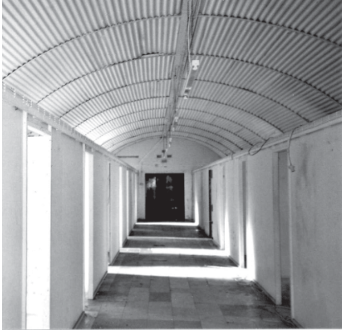
Fig 1: Nissen Hut, Cage 9, (c. Jan 2005)