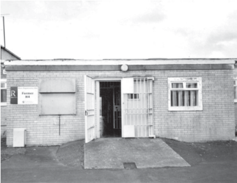
Fig. 2: Entrance to H Block 4, HMP, the Maze (January 2006)

The use of the name 'the Maze', for the series of H Blocks that were built between 1975 and 1976 and which immediately started to house paramilitary prisoners, was often used by officialdom and, to an extent, the general public as the official name for the site. However, prisoners did not, and still do not, use this term as it was generally accepted, by both the imprisoned and the imprisoners, that the change in name was part of the policy to change the status of the prisoners (Stevenson, 1996: 38). The eight blocks were swiftly constructed on a 'H' plan, with prison accommodation being placed within the four wings on the parallel long sides and the administration being located at the central point (Fig. 2).