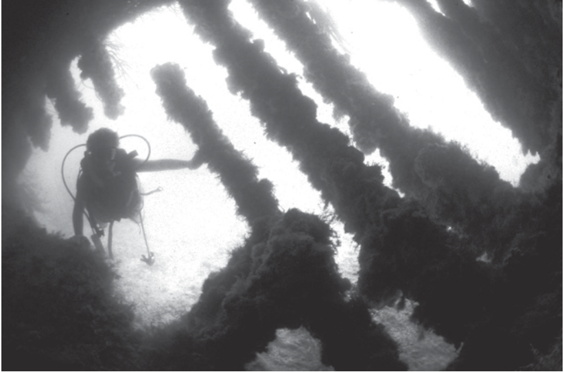
Figure 3: Divers on the Santa Lucia, wrecked off Bermuda 1584.

between conflicting ideologies has not yet taken place (Smith, 2004). The current aftermath of this legislative change is a crucial moment in the short timeline between treatment of the island's underwater heritage as an exploitable, uncontrolled commodity to a publicly entrusted, non-renewable, and highly regulated resource. Bermuda's underwater heritage has been redefined within one generation, leaving Bermudian 4 publics and heritage practitioners to face a difficult and unsettled legacy.