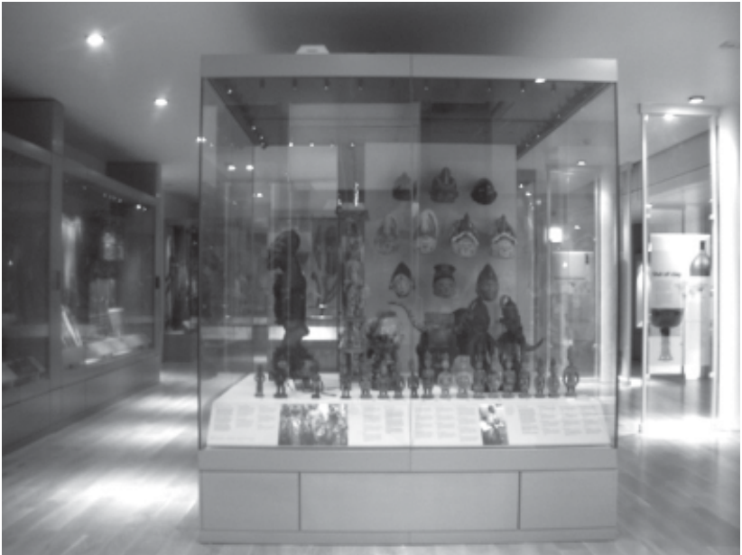
Fig. 1. 'Masks and Carvings display', Living Cultures Gallery

embark on an extensive capital development project (Annual Report 1997-1998). This project entailed the building of a new extension to the museum and created the space for a second Living Cultures Gallery, into which the Gelede masks became incorporated. They are now displayed alongside other West African objects in a large case, which faces the visitor as they enter. The effect of this case is visually dense, with small Ibeji 4 figures arranged along the front and dominating pieces such as Minkisi 5 figures and two-faced masks towards the back. The Gelede masks are hung above these on the back wall (Fig 1). Although containing many of the objects included in the previous 'Associations and Rituals' display, the theme of this case has changed to 'Masks and Carvings' thereby shifting the interpretation away from a consideration of their abstract, spiritual meanings towards a functional understanding concerning their manufacture and use. This change in terminology accords with the other themes chosen for the gallery, which also privilege object types 6 .