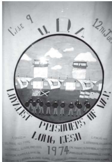
Fig. 4: Loyalist Banner from 1974, Image from Conflict: the Irish at War Exhibition, Ulster Museum. 2005.

War, at the Ulster Museum, which has had a greatly extended run and won the Irish Exhibition of the Year award for 2005, is also an interesting example of how to present the more painful aspects of the recent past. This exhibition contained memorabilia from prisons, including loyalist banners depicting Orange Order style processions in the compounds of the Long Kesh Internment Camp in 1974 (Fig. 4) as well as artefacts connected to victims, such as a poem written by a five year old child who was subsequently killed in a car bomb. Such powerful exhibits, when sensitively displayed and interpreted, can promote understanding and attempts at reconciliation far more effectively than through merely removing all remnants of 'the Troubles' so thoroughly that we can pretend that they never existed.