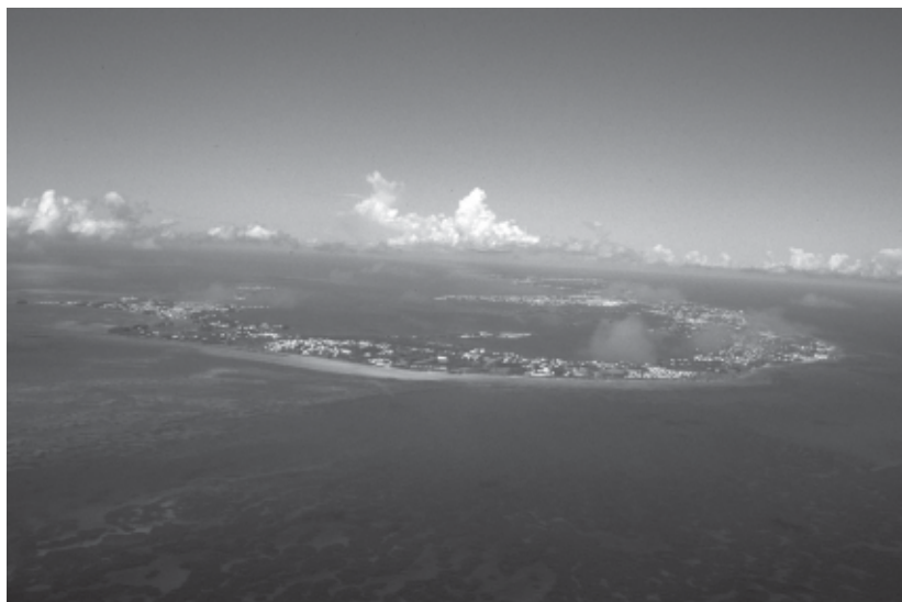
Figure 1: Aerial view of Bermuda, 2002.