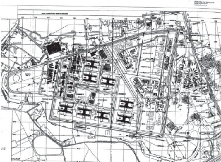
Fig 3: Aerial Map of Long Kesh/Maze. (Image courtesy of Dr John O'Neill. January 2005)

had their own, both individual and shared, impacts on their surroundings. Also, the prison was not only created and shaped by 'the Troubles' but the prison equally had an impact on the course of the recent conflict. This makes the site ideal in being used to cut through the myths and propaganda on all sides and to try to show the different stories of those who were implicated in, and affected by, the recent conflict in Northern Ireland. In this respect the site could become a major research and educational tool, as is proposed to some extent with the I.C.C.T. (M.C.P., 2005: 15-17), but it can also be a major site of reconciliation through attempts at understanding the attitudes and roles of all sections of society both directly and indirectly impacted by the site.