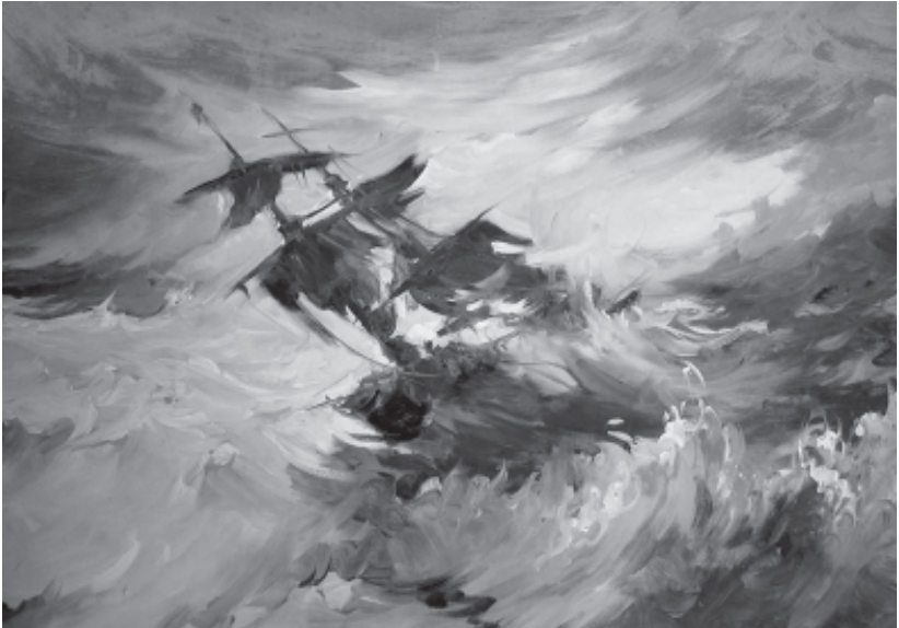
Figure 5: Oil painting of the Sea Venture, unknown artist.

professional ethics from actual museum practice, is to demonstrate and 'confront the fact that our expertise consists of (re-)negotiating the different and often antagonistic moral complexes that take place in [particular] locales' (Meskell and Pels, 2005). Our credibility as heritage managers comes from this understanding and in leading by example. Just as today's Bermudian salvage divers must adapt their behaviour for the sake of preserving the island's submerged archaeology, local museums should incorporate change into their curatorial strategies. Ultimately, we strengthen heritage management and museum practice by stretching to hear and integrate alternative perspectives.