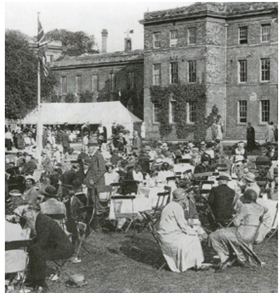
A GARDEN PARTY IN THE COLLEGE GROUNDS FOR THE BRITISH ASSOCIATION FOR THE ADVANCEMENT OF SCIENCE, SEPTEMBER 1933

credits the scholarship with alleviating some of the financial stresses of studying with a young family, "I've been able to properly sit down and study for assignments and exams without having too many concerns about finances."